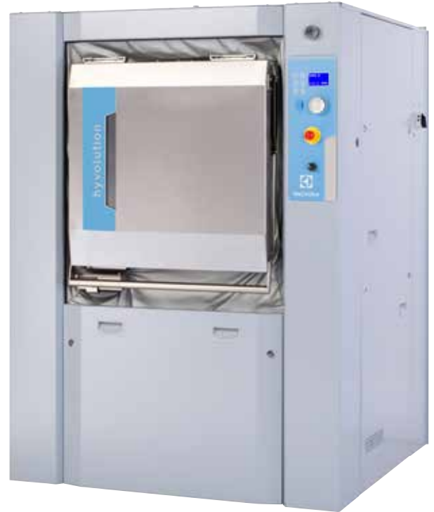
Images shown are a representation of the product only and variations may occur.